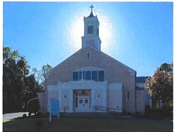
St. Zepherin Church